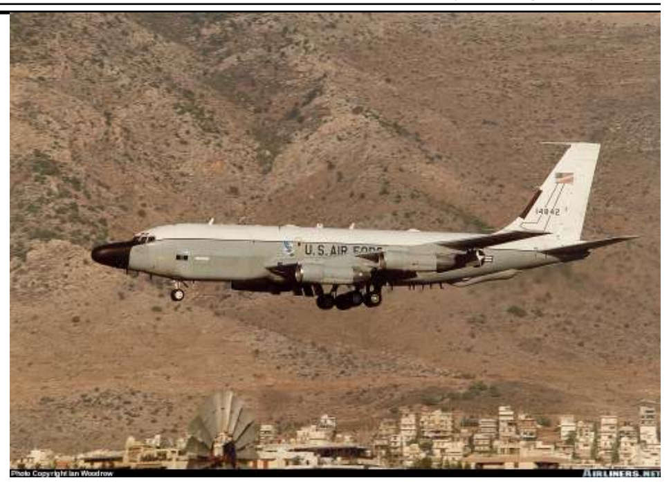
No Hotel or Reunion Date Yet, SO Aircraft 842