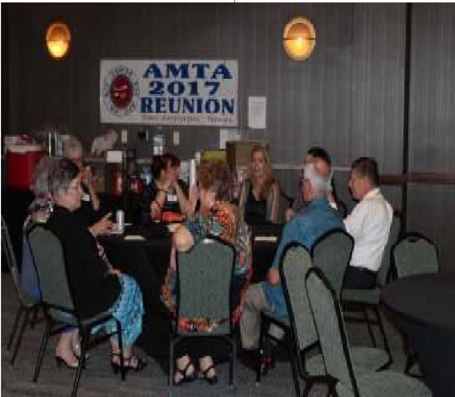
Just a friendly chat in the Hospitality