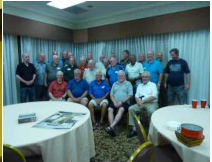
A Blast From The Past :- 2011 Reunion Silent Auction