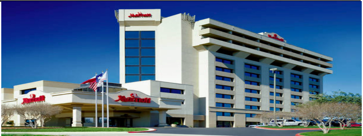
San Antonio Marriott North