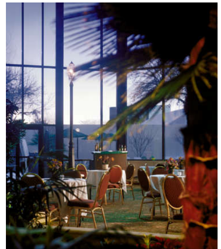
Banquets and Receptions