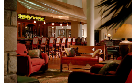
Marriott Hotel Lounge

http://www.25af.af.mil/news/story.asp?id=123451441