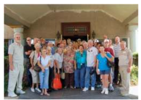
Waiting on bus for Greenville Tour

all who might read these words is that as a believer you would be firm and steadfast in your faith and for those who might not be believers I pray you would consider this faith called Christianity. For many of us it is more than a belief, it is a lifestyle. It is the faith of our fathers and it is the principles on which this great nation is built. Those of us who have exercised this faith for many years should be very grateful for the way we were raised and we should see that our children and grand children are raised to know HIM and to live this lifestyle also.