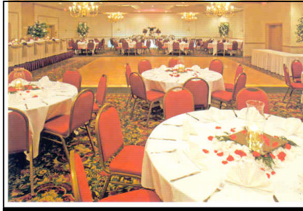
The Banquet room at the Regency Hotel