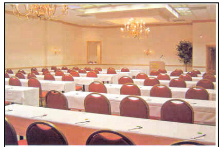
The Meeting room at the Regency Hotel