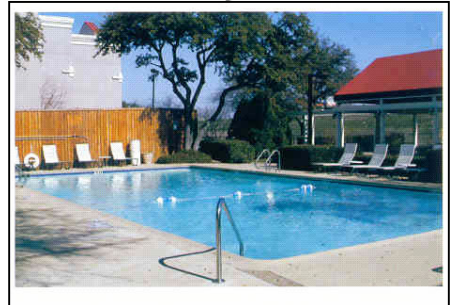
The Swimming pool., I'm sure this will be a popular area.