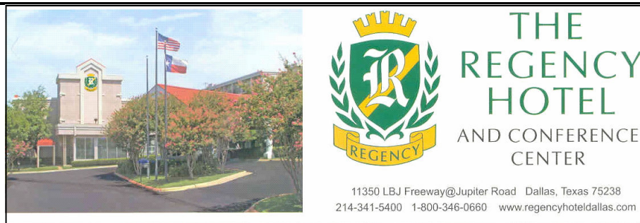
THE Site of the Dallas 2007 AMTA Reunion, the newly remodel Regency Hotel.

I hope everyone is making their travel plans for the 2007 reunion as October is just around the corner. I visited the reunion hotel and the upgrades are going well. As you may know, we have established the menus for the banquet which can be accessed from our website. The Tenison Park golf course has been selected and I think everyone will be pleased with the course and fee. Range balls and food will be furnished as part of the deal.