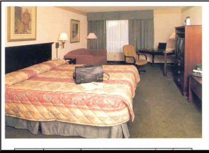
Typical room layout.