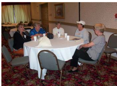
The ladies enjoying the chance to swap stories about their husbands