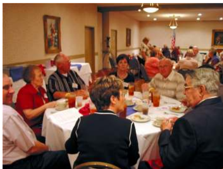
We enjoyed a Texas style banquet, good food and good friends