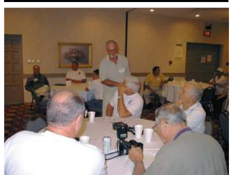
Some of the guys setting around swapping stories and getting re-acquainted after many years.

You can sit around and complain about what's wrong with something, but if you don't get involved it'll never get changed.