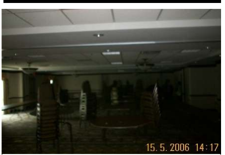
Ballroom at the hotel.